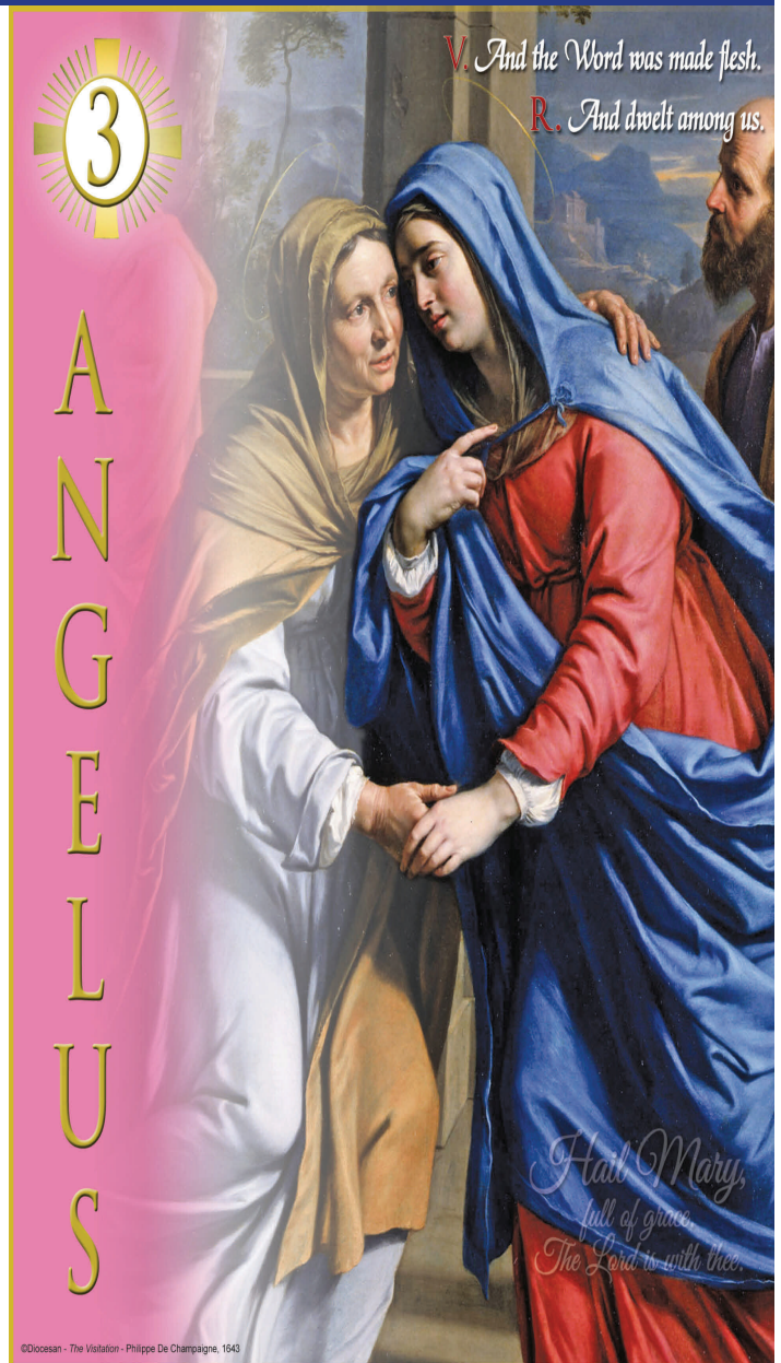
The Visitation - Philippe De Champaigne, 1643

Marriage: Couples are asked to contact the priest at the beginning of the period of engagement or at least six (6) months prior to the desired wedding date.