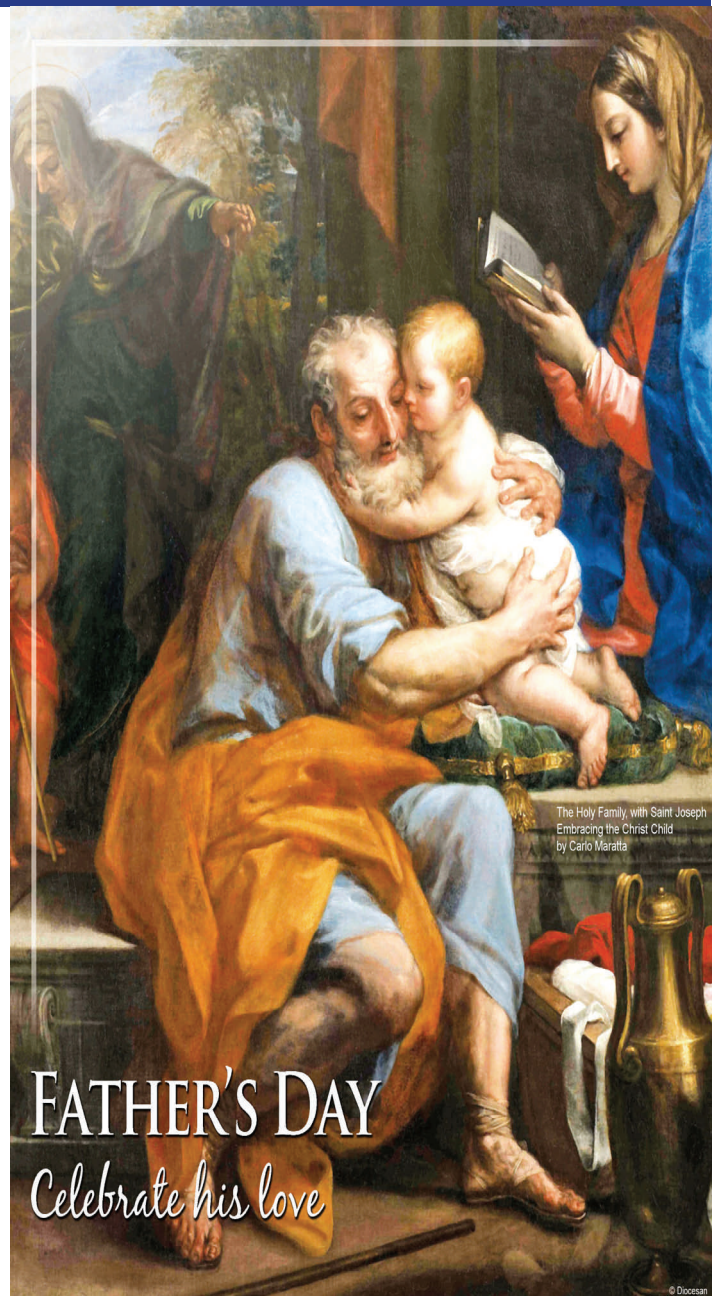
The Holy Family, with Saint Joseph Embracing the Christ Child by Carlo Maratta

Marriage: Couples are asked to contact the priest at the beginning of the period of engagement or at least six (6) months prior to the desired wedding date.